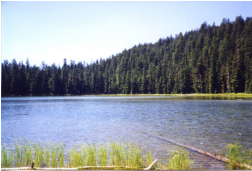
Twin Lakes